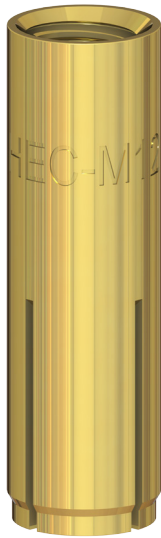
Non-Lipped Zinc Yellow