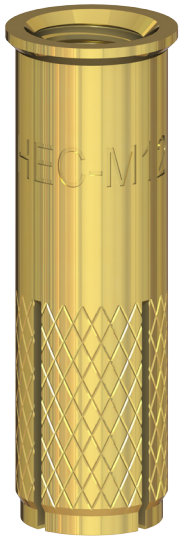
Lipped Zinc Yellow