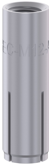
Non-Lipped Stainless Steel

The Hobson Drop-In Anchor is a versatile medium duty anchor that delivers ample load bearing performance at shallow embedments. An expansion wedge inside the anchor is pushed towards the bottom end, thus producing expansion forces. The generated expansion force produce frictional resistance during anchor loading.