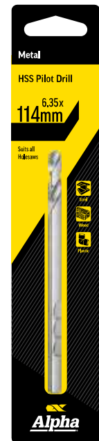
CARDED - 1 PCE Supplied in hangable card