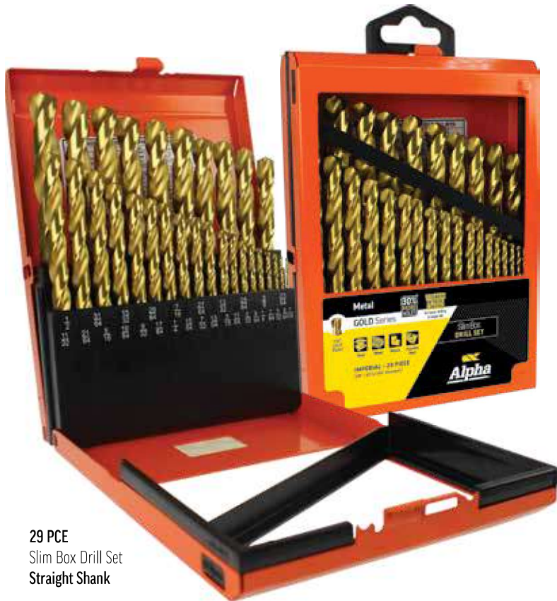
29 PCE Slim Box Drill Set Straight Shank