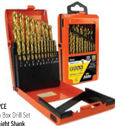
21 PCE Slim Box Drill Set Straight Shank