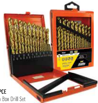
29 PCE Slim Box Drill Set Straight and Reduced Shank