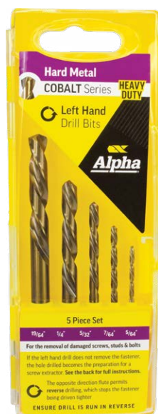
5 PCE Left Hand Drill Set COBALT Series Sizes: 5/64", 7/64", 5/32", 1/4" & 19/64"