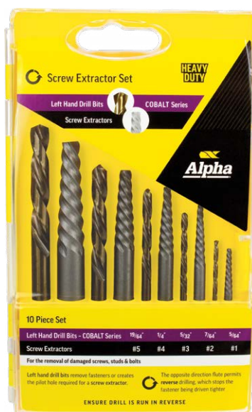
10 PCE Screw Extractor Set 5 x Left Hand Drill Bits: 5/64", 7/64", 5/32", 1/4" & 19/64" 5 x Screw Extractors: #1, #2, #3, #4 & #5