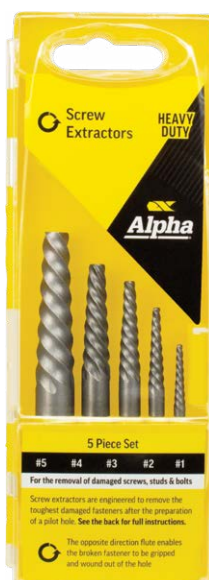
5 PCE Screw Extractor Set Sizes: #1, #2, #3, #4 & #5