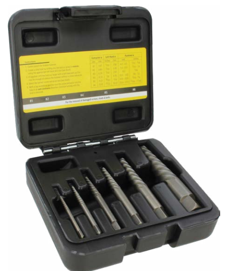
6 PCE Screw Extractor Set Sizes: #1, #2, #3, #4, #5 & #6